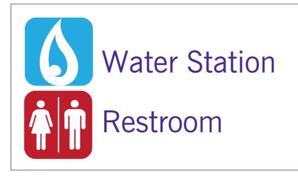
2014 Valley of the Lilies Half Marathon Course Map